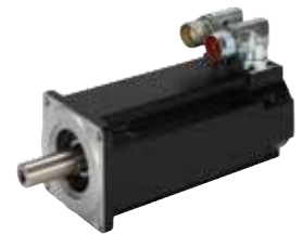
5 AKM™ Servomotor

Kollmorgen drives combine performance, flexibility, and ease of use with Kollmorgen Automation Suite and all Kollmorgen servomotors and linear positioners. Multiple communications bus options, plug-and-play commissioning, exclusive Performance Servo Tuner algorithm, multiple feedback options, and industry-leading torque and velocity loop bandwidth provide you the flexibility to bring the right solution to your machine.