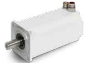
4 AKM™ Washdown Servomotor

Kollmorgen Automation Suite™ dramatically shortens development time while increasing machine throughput by as much as 25 percent or more. Our exclusive Pipe Network™ provides a drag-and-drop representation of your machine to enable quick, error-free programming of complex, multi-axis motion.