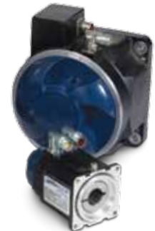
6 Cartridge DDR™ Motor

Kollmorgen's AKD™ Near and Integrated servo drives provide lower total system costs and save space in multi-axis OEM packaging machines by reducing cabling requirements and cabinet size. The AKD Near Drive provides all the benefits of an IP65 protected decentralized drive installed directly on your packaging machine without any de-rating of the motor or drive.