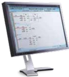
1 Kollmorgen Automation Suite™