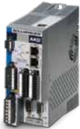
2 AKD™ Drive